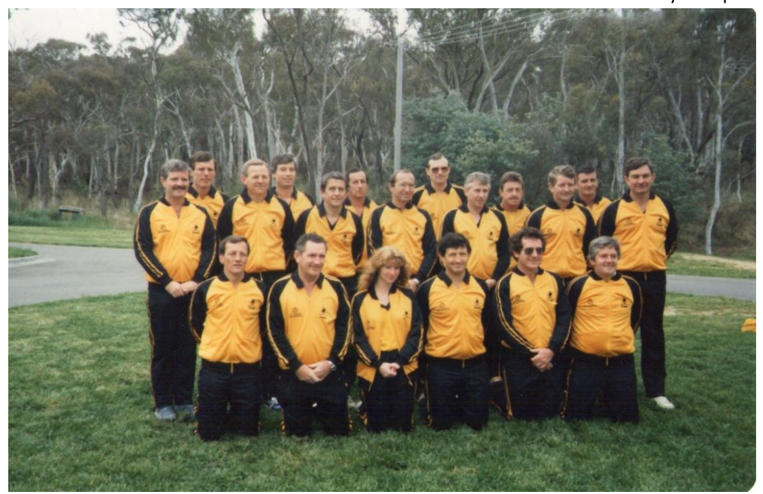
Veterans were very young in the olden days

<u>Were They The Good Old Days?</u>: Readers are invited to identify themselves in this team as 'Masters Matters' is unable to provide any names (Rusty excepted) other than a few guesses. Other historical information taken from the 'Veteran Visor' newsletter of 1989 can be found on Pages 7 and 8.