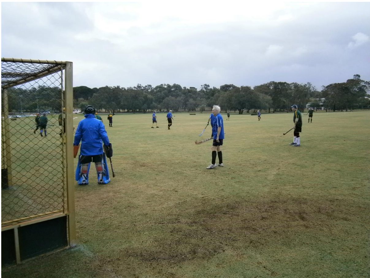
Left wings just need some good passes to the right place

# The bar hit a low point on the 20th with the till being $16.30 short. Thanks to all members who expressed their concern and who clearly put extra money in on the 27th. By the way, we count the till before going home each Saturday and a pile of shrapnel as has been found the last two weeks is not helpful in getting away; especially when it does not add up to whole dollars to match our prices.